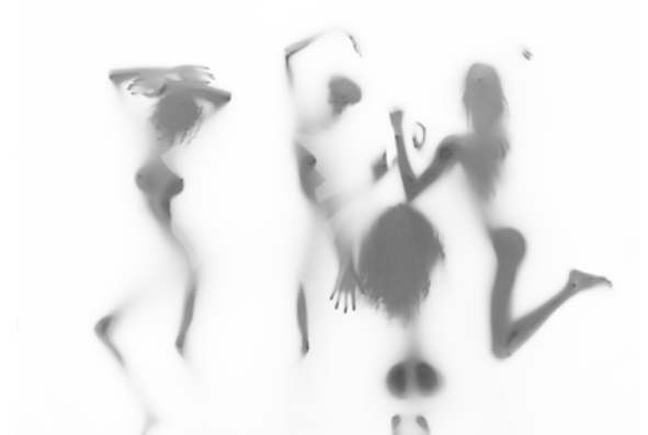
The Three Sisters and the Mother