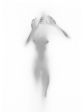
Limits of Aminos