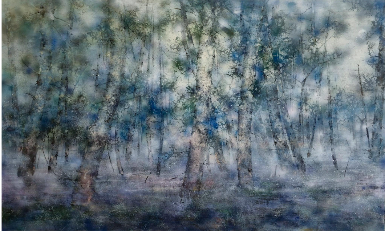
Promenade I, 2025, Mineral pigments on Japanese, paper mounted on wood, 43 × 71 in.